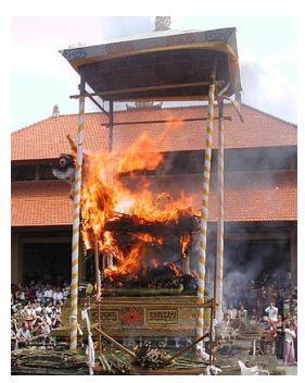
Cremation of the dead by Hindus in Ubud, Bali Indonesia.

Hindus brought into <u>Trinidad</u> as indentured laborers for plantations between 1845 and 1917, by the British colonial government, suffered discriminatory laws that did not allow cremation, and other rites of passage such as the traditional marriage, because the colonial officials considered these as pagan and uncivilized barbaric practices. The non-Hindu government further did not allow the construction of crematorium.<sup>[20]</sup> After decades of social organization and petitions, the Hindus of Trinidad gained the permission to practice their traditional rites of passage including Antyesti in the 1950s, and build the first crematorium in 1980s.<sup>[20]</sup>